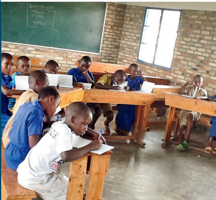
Inside one of the schools attended by sponsored children.