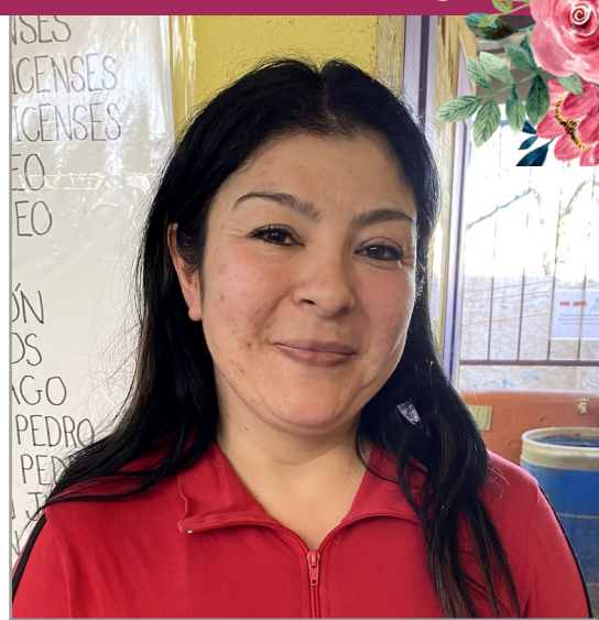
Casa Hogar is a well-run, loving children's home in Mexico. Currently 16 children reside there. When we visited this orphanage, we found out that they desperately need help to buy food.