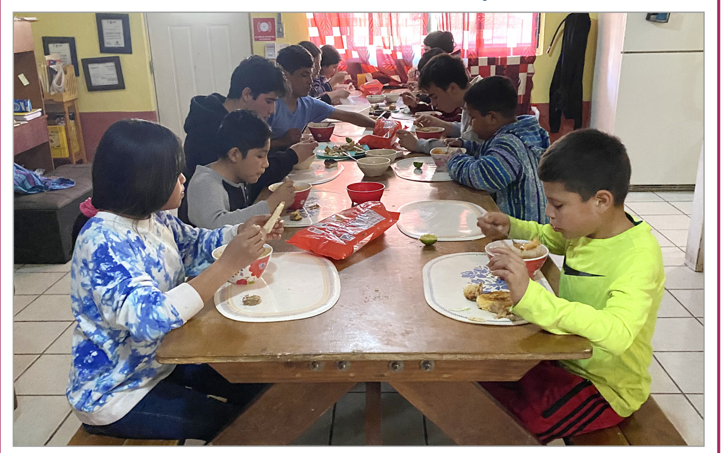
The Casa Hogar children enjoy their lunch. On behalf of these beautiful children, we ask for your kind support.