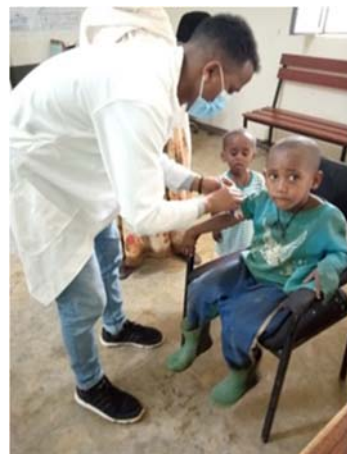
Annual health check up