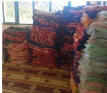
provision of day and night clothing for community children