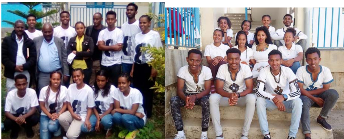
8th round reintegrated children