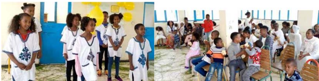
Ethiopian New year celebration in 2014

As part of the Community Bridge of Hope Childcare Centre usually celebrate the New Year very warmly. The celebration of 2014 (Ethiopian Calendar) with all our children, mothers and staff members was very warm and joyful.