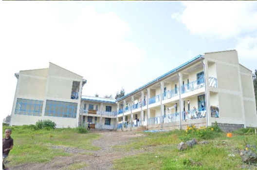
Partial view of BoH Children's Village