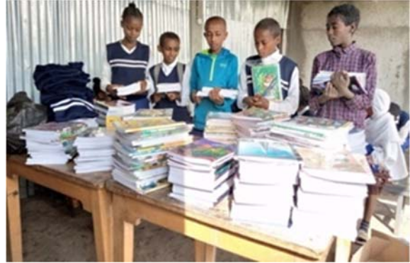
School Material distribution