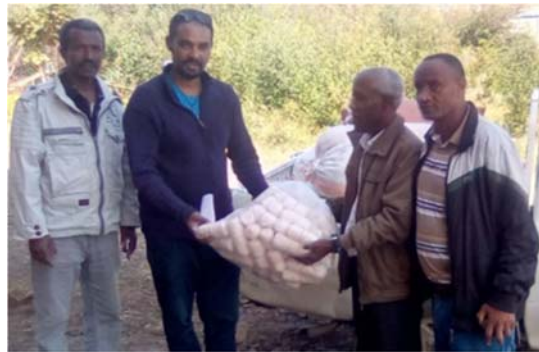
Hand overing the supports in kind