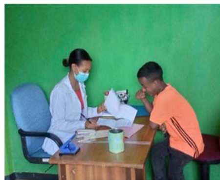
BoH Village counsellor on duty