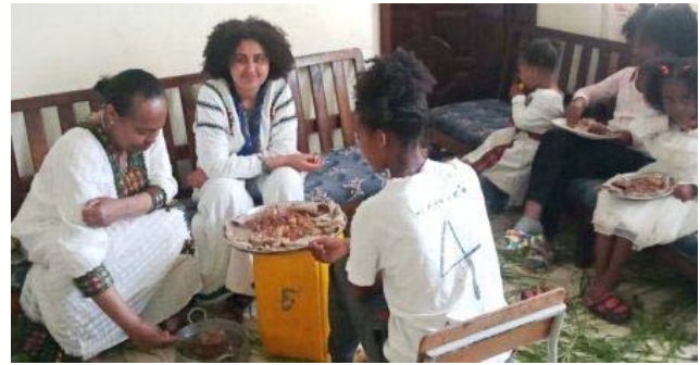
BoH family type childcare

The head woman of the family that we call “mothers” are the nucleus of BoH family type childcare system. On the other hand, BoH woman headed families are playing the greatest role to substitute the lost natural family of our orphan and highly vulnerable children and compensate the lost natural parent–child relationship.