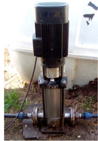
Vertical surface pump

As a result, in the year 2021, the scarcity of water in the entire children village including Magdalena School had been totally resolved.