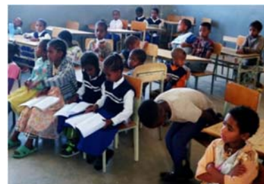
Graduation of KG3