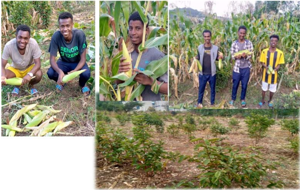
Harvesting maize and picture of fruit trees

Our children enjoyed with taking care of the garden behind every family house. Especially during the rainy season, they had been able to harvest maize so that it had been distributed to each family houses. Different fruit trees, such as Guava, orange, mango, and avocado has also been planted.