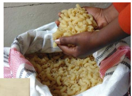
of food handlers and the kitchen area.