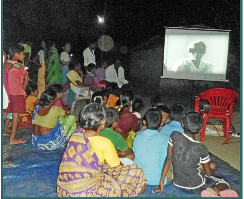
Villagers watch a video with trafficked women who tell their stories.

After the movie is shown, team leaders lead a discussion about steps the people can take to protect their children.