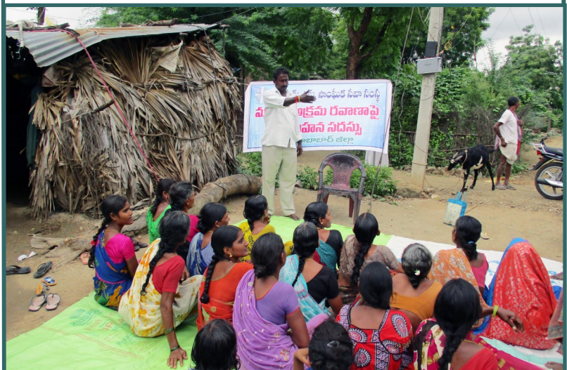
Village women attend classes about trafficking.

"India is the most dangerous country for women in terms of human trafficking, including sex slavery and domestic servitude, and for customary practices such as forced marriage and female infanticide." —Thomson Reuters Foundation