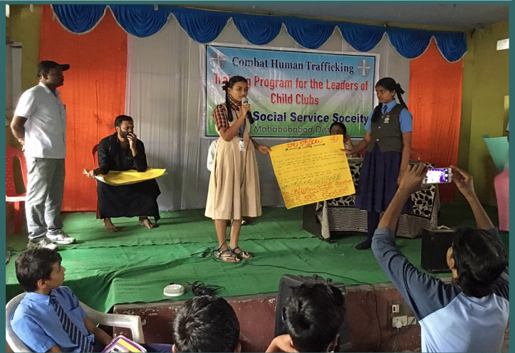
A student speaks during a Child Club leadership training course.

They have worked in one district in the state of Telangana for the past three years. Now they plan to add two more districts. Each district is comparable to a county in the U.S. Last year government teams rescued 300 children in the two districts. Forty of the children were rescued from brothels.