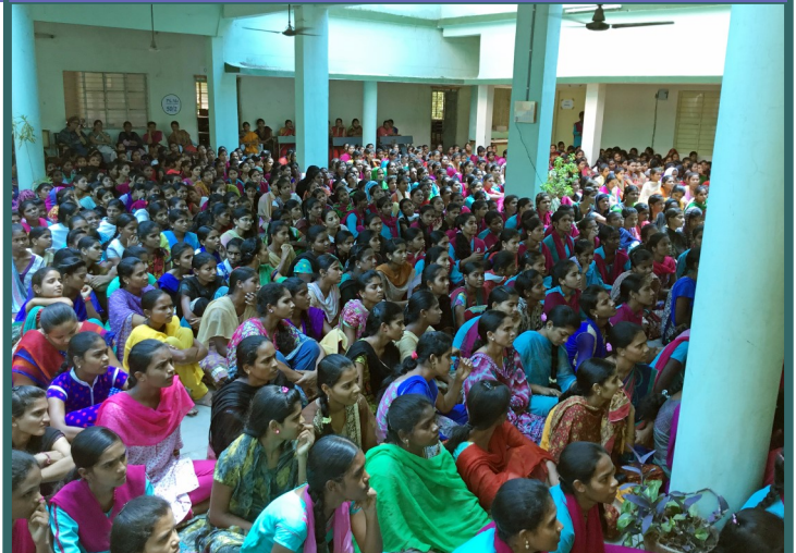
School assemblies are an important part of the anti-trafficking campaign.

The most enthusiastic students in the 6 th through 9 th grades are invited to form a Child Vigilant Committee (CVC) in their schools. These are students that other, more timid students can approach with troubling information. The CVC students then decide whether or not to call the Childline hotline or to first talk with teachers or village elders. All over India people are being urged to call the Childline number on their cellphone if they see a child in danger.