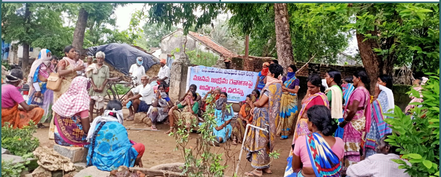
Mothers meet in this village to learn how to prevent trafficking.

Thank you for helping to prevent girls and women from becoming victims of trafficking.