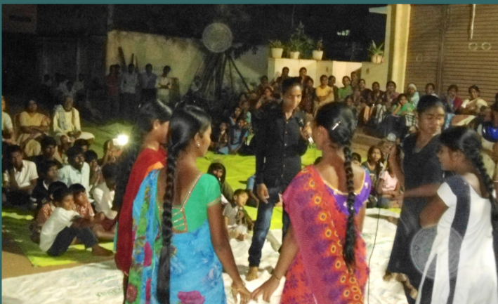
School children perform a play for their village demonstrating how to recognize and stop traffickers.