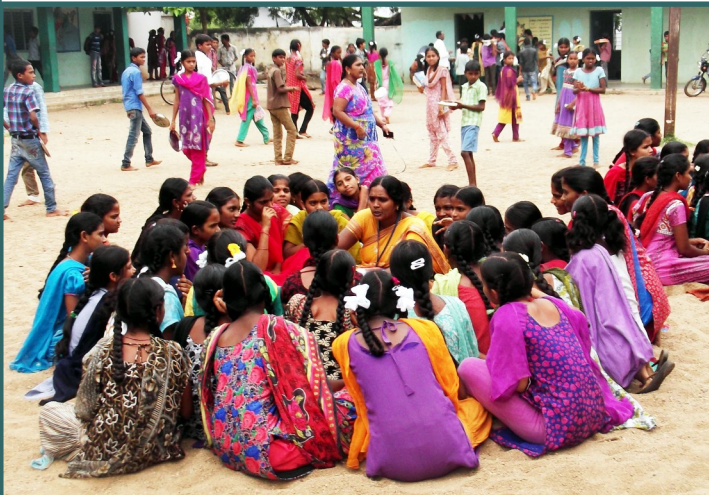
While other children play in the school yard, these concerned girls are forming a Child Vigilant Committee (left). Children discuss vigilance in a committee meeting (right).