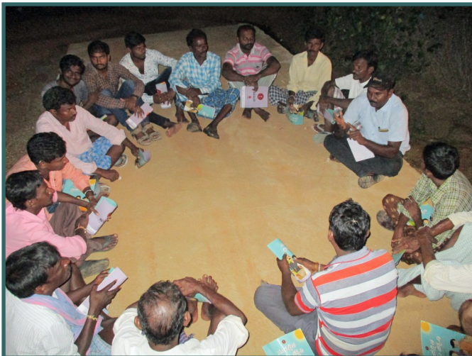
A village meeting for fathers