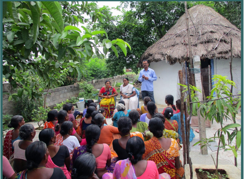
The women are meeting with a local council elder to discuss how to end trafficking in their village.

The continuing program will serve 393,629 people in three districts that include both urban and rural communities. With a blanket of watchful eyes, we believe child trafficking can be stopped in this targeted area.