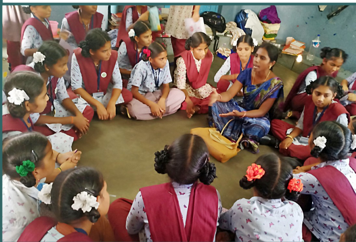
Child Club meeting

We tend to think of traffickers as cunning men who kidnap or trick families in order to get children they can sell. And while that is often true, the roots of this problem are deeper than that. Many times a relative – even a parent – is willing to sell a child in order to make some money.