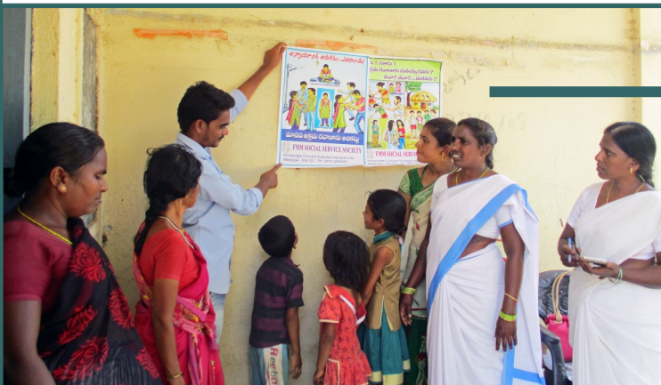
Every village has a government nurse. Anti-trafficking posters are being placed in this clinic where the nurse can further explain how traffickers operate.

Because traffickers move in and out of a village quickly, the team is creating communication networks between nearby villages. If a child is suddenly missing, calls are made to neighboring villages asking about any suspicious people or about frightened children seen accompanying an adult. Already this quick response network has allowed the PCT team to rescue girls from their traffickers.