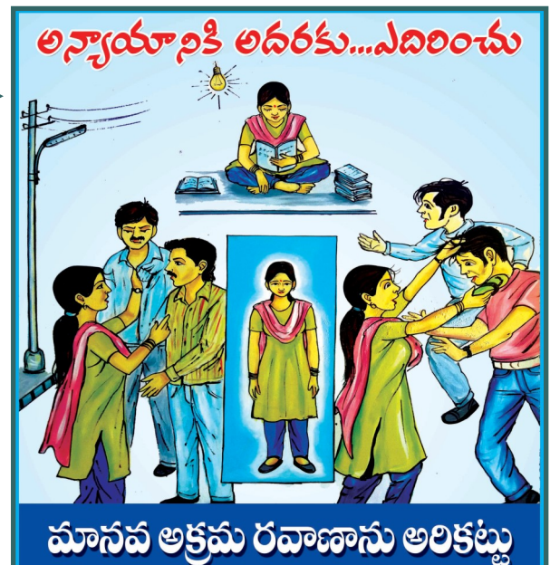
Education, awareness and community vigilance can end child trafficking.