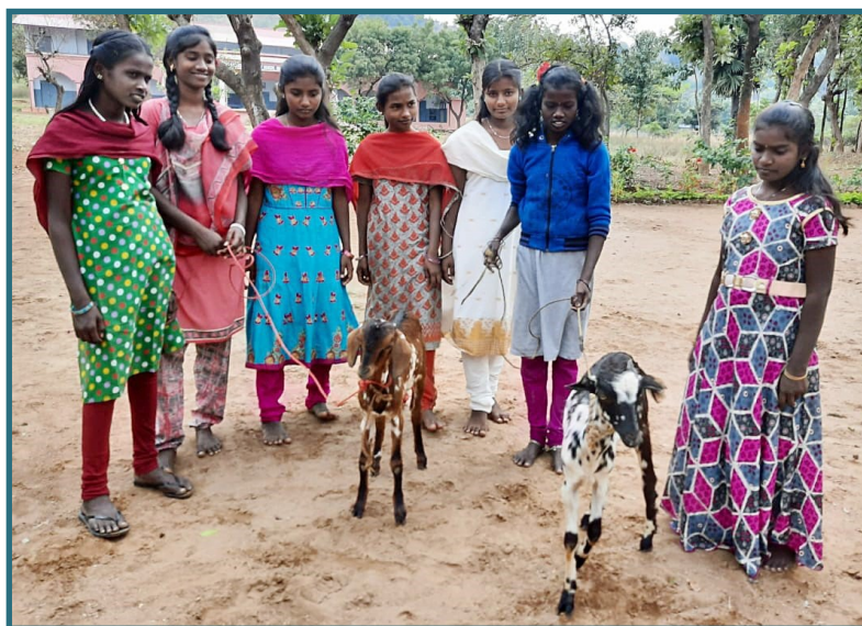
Girls at Annai Scholastica Children's Home are getting to know their new goats.