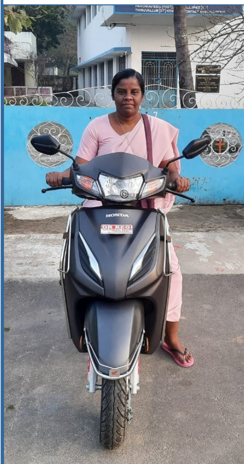
Photo (left) shows the scooter you provided for Pandaravedu Orphanage last year. This year, four homes have requested help to buy scooters.

“Athipet Children’s Home is situated in a hilly slope called Jawadhu Hills. Transportation is very poor in this area. There is no bus service to this village. That makes it difficult for us to reach the town for emergencies, and for buying provisions, vegetables and other needs of the children.”