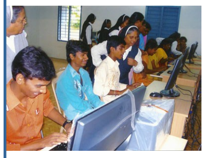
Bethel Computer Lab