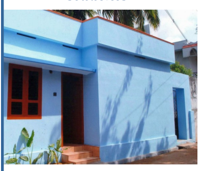
St. Joseph's Home kitchen