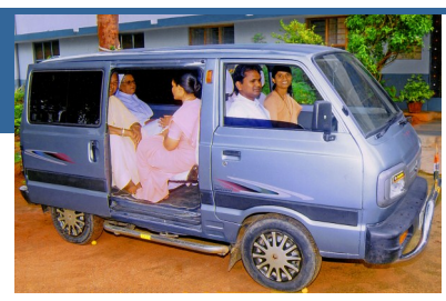
Van for St. Elizabeth's